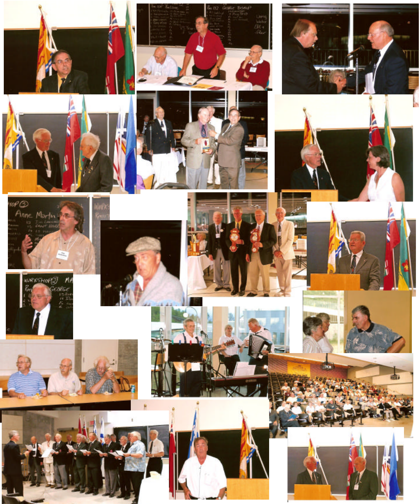
HANDSHAKE Page 20 FALL 2007