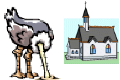
Nope, can't see any men's clubs in the United Church.